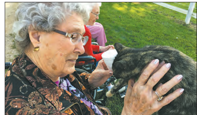
A Tuff Memorial Home resident enjoys petting one of Rock Ranch's cats during a fall outing to the Hills ranch.