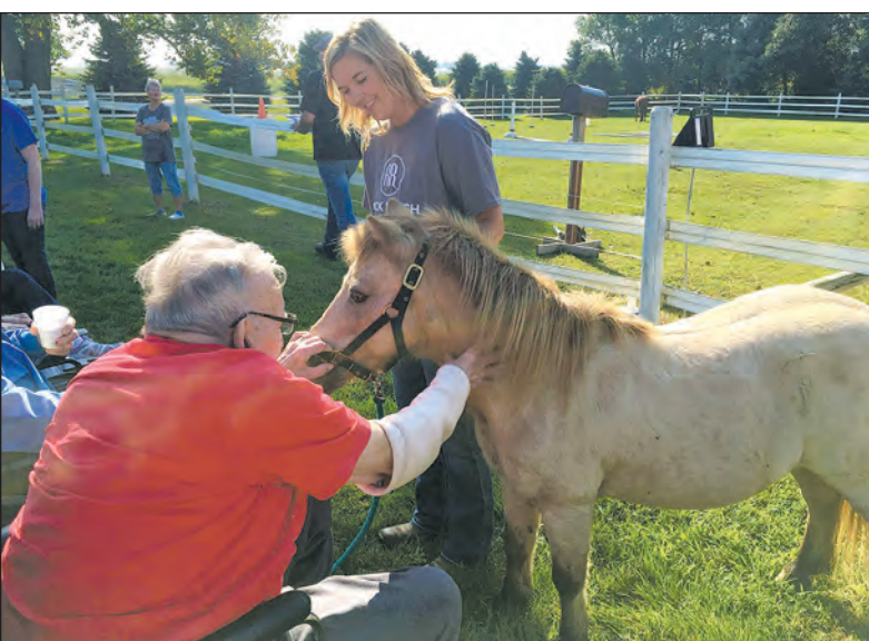
Special to The Globe